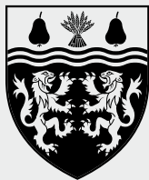
Primary logo (solid black)