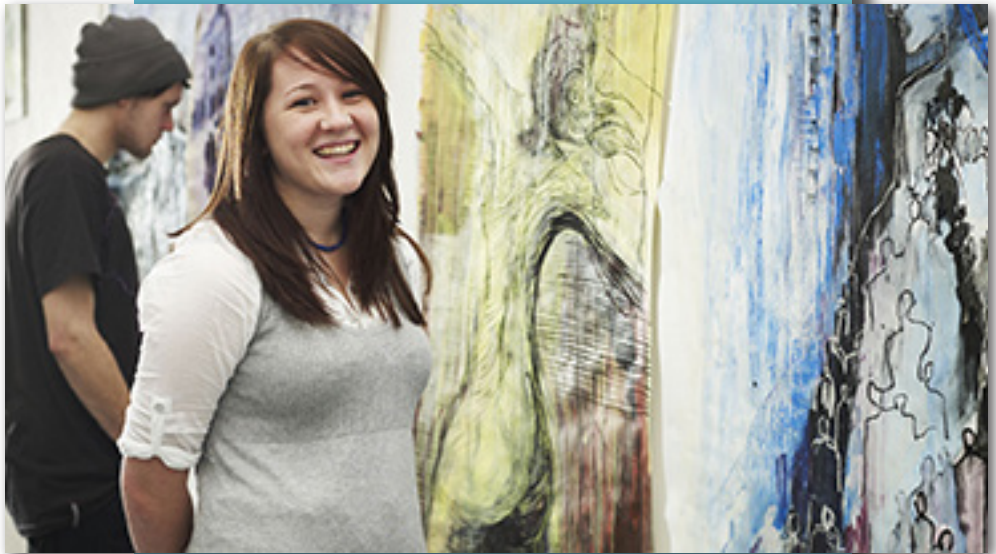
Figure it out...

Taking charge of your finances is an important aspect of your life after graduating from university. This guide sets out to give you help and advice on subjects such as continuing your study, employment, benefits, banking, living costs, budgeting etc.