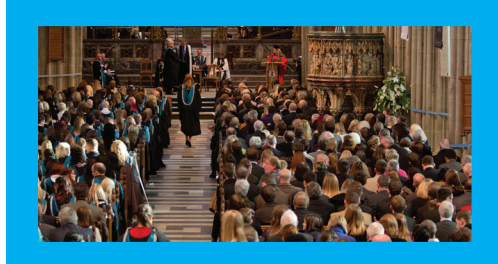
67% of University of Worcester graduates in employment are working in the West Midlands. Of these, 49% remained in Worcestershire